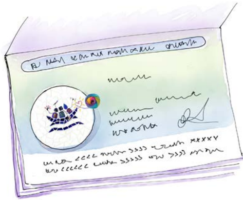
L'Arche is us together