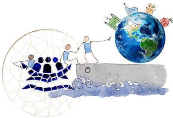
We have a common mission